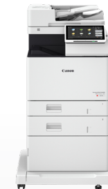
iR ADV DX C477