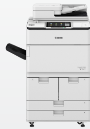
iR ADV DX 6700