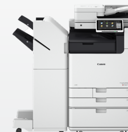
iR ADV DX C5800