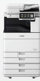
iR ADV DX 6000i