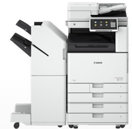
iR ADV DX C3700